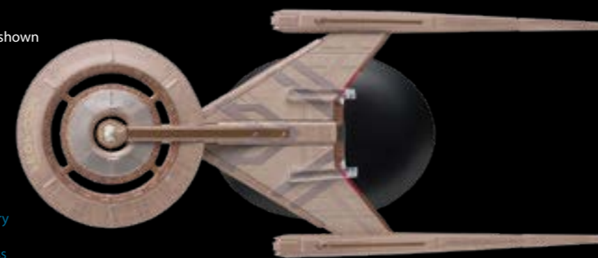
U.S.S. Discovery NCC-1031 Crossfield Class