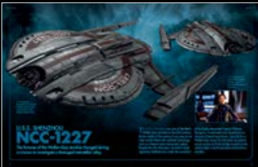
Profiles of every ship, featuring new CG imagery that has never been seen before.