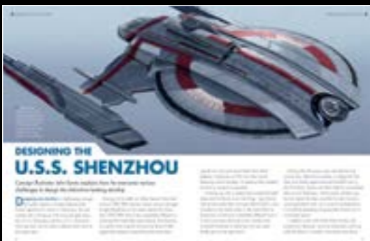
The inside story of how each and every ship was designed with original production art.