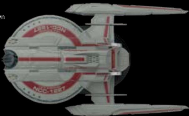
U.S.S. Shenzhou NCC-1227 Walker Class